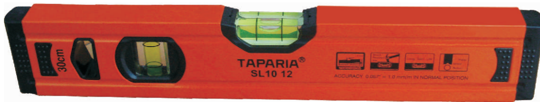
1mm / mtr. Accuracy