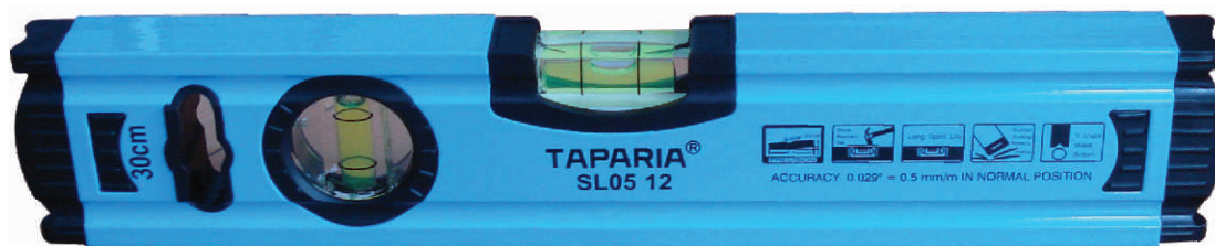
0.5 mm / mtr. Accuracy